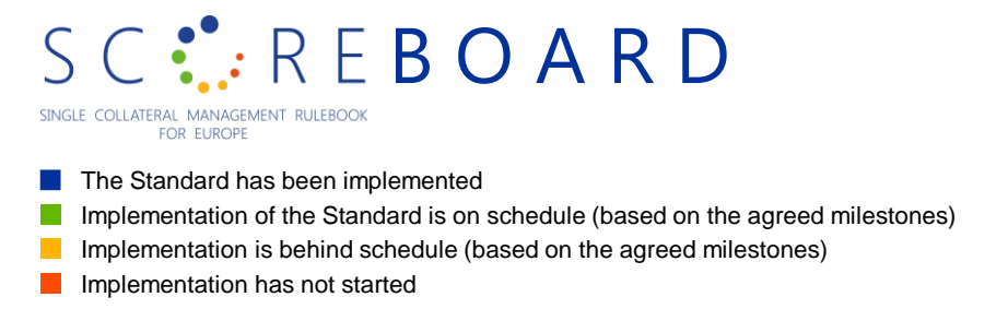
Table 1 Compliance level with the standards by each entity type