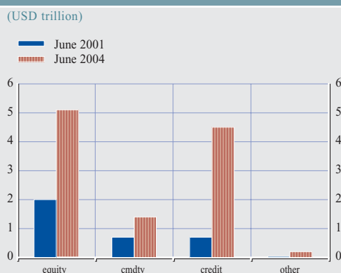
Chart B17.2 Outstanding amounts of OTC derivatives